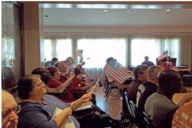
The U S Flags were waving high during the Flag Day Ceremony