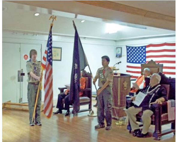
Boy Scout Troop 814 presenting the Colors