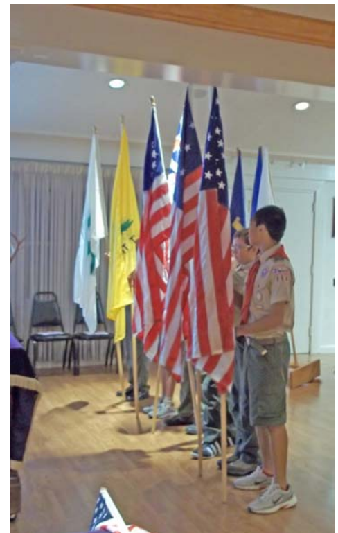
The history of the Flag